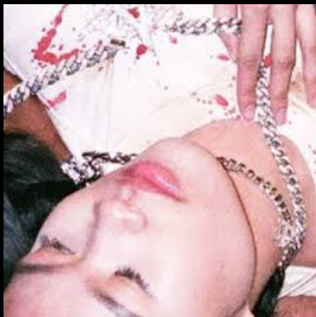
Cover art for "Love Hurts"