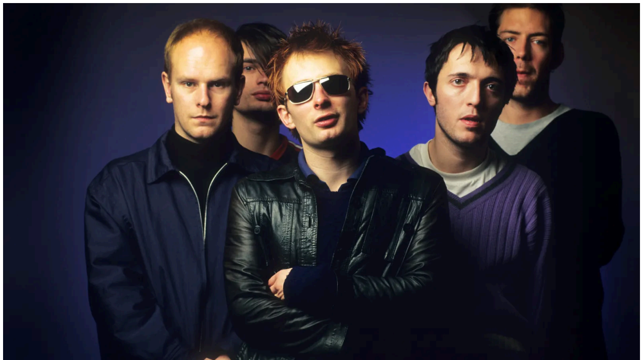
Photo of the band from 1995.