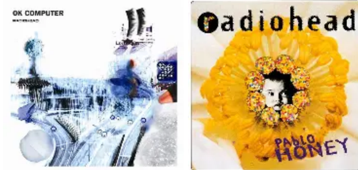
Ok Computer Album cover | Pablo Honey Album cover

Radiohead is an English rock band from Oxfordshire. The band members are Thom Yorke (vocals, guitar keyboards) Jonny Greenwood (guitar, keyboards, other instruments) and Colin Greenwood who are brothers, ed o'brien (guitar and backing vocals) and last but not least philip selway (drums). Radiohead's biggest hit known as "OK Computer" released in 1997 and their first album is called pablo honey which includes radioheads debut single and first big hit "creep". Radiohead lately has been on a seven year hiatus but has just returned to touring this year (2025).