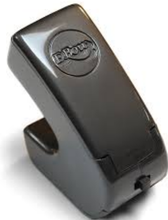
E-bow (electronic bow) used on "my iron lung"