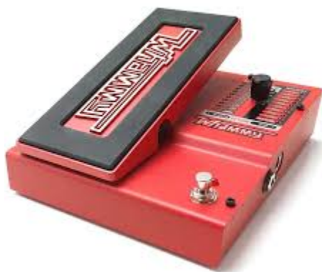
Digitech Whammy pedal used on "My iron lung" and "just"