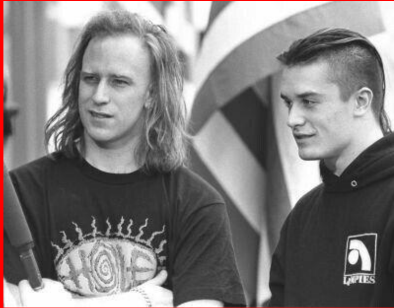
Singer Mike Patton(right) and keyboardist Roddy Bottum(left) Circa 1990.