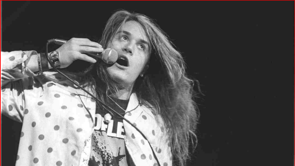
Singer Mike Patton during The Real Thing tour. Circa 1989-1990.

Then after touring they started working on their second album with Mike Patton, Angel Dust . This one showed a more experimental and weird sound unlike the more straightforward funk metal sound of their previous work. This one was not as commercially successful in the U.S. although it outsold The Real Thing in numerous other countries. Tensions during